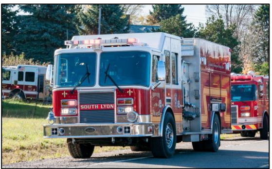
(above) Engine 2 – 2008 KME