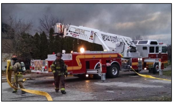
(above) Ladder 1 – 2000 KME Aerial