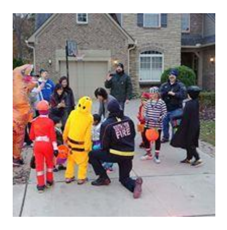
FF Tooman Halloween 2017