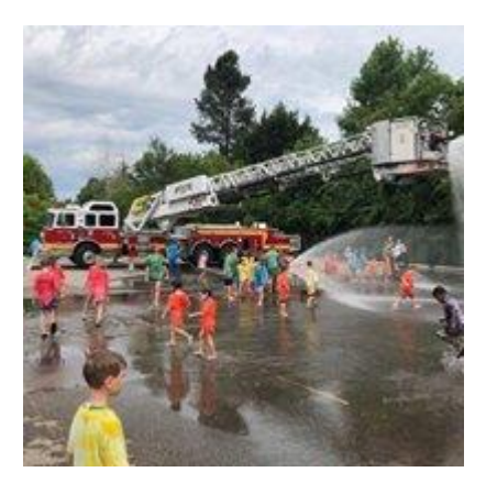
Spray Park 2018

Crews regularly check and install 9-volt batteries and new smoke detectors.