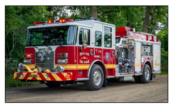
(above) Engine 1 - 2016 Pierce Sabre Predator

2018 the South Lyon Fire Department received a new Command vehicle which replaced an aging, gas guzzling 2005 Ford Excursion. The new vehicle is a 2019 Ford Interceptor. The 2005 Excursion was sold to the Augusta Fire Department. Also, in 2018 major work was done on the 2000 KME ladder truck, spending much less money than council approved. I believe these repairs will allow us to get 5-7 more years out of the vehicle before we begin discussing replacing the truck. The next vehicle that will need to be addressed is the 2008 KME Engine 2. The vehicle has some body issues that we will need to repair in the near future.